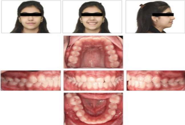
Figure-1: Pre-Treatment; Extraoral & Intraoral Photographs.

Interproximal reduction (IPR) is a method involving the precise removal of a thin layer of enamel between adjacent teeth to alleviate crowding [10]. Various techniques for IPR exist, such as the use of burs, discs, and abrasive strips [11]. In this particular investigation, thin diamond-coated double-sided abrasive strips were employed for IPR. The procedure was carefully measured using an IPR gauge, and afterward, topical fluoride was applied to prevent any potential adverse effects.